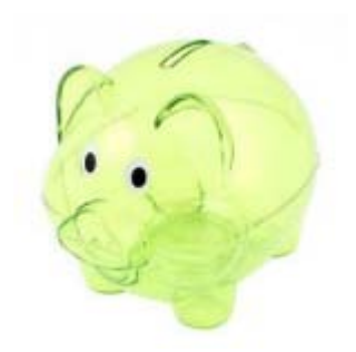
Don't forget to feed the pig!

Every dollar you place in the "Polio Pig" goes to polio eradication